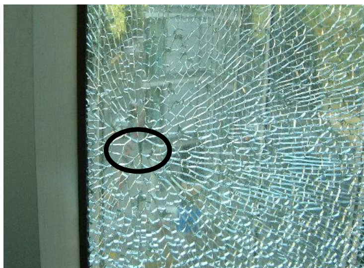
Typical breakage starting from a NiS inclusion

In this case, we find a characteristic breakage in the shape of butterfly. Many articles and publications exist on the subject. The phenomenon is inherent to thermally toughened glass, and can therefore not be considered a hidden defect of the product.